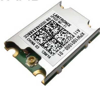
xPico Wi-Fi Actual Size

As one of the smallest embedded device servers in the world, xPico Wi-Fi can be utilized in designs typically intended for chip solutions, befitting in advantages to cost and time-to-market. Its “zero host load” eliminates any need for drivers on the connected microcontroller making implementation easy and fast with virtually no need to write a single line of code. This translates to considerably lower development costs and faster time-to-market. As xPico Wi-Fi meets FCC Class B, UL and EN EMC and safety compliance, your development time is shortened. xPico Wi-Fi can reduce the overall cost of ownership compared to the competition.